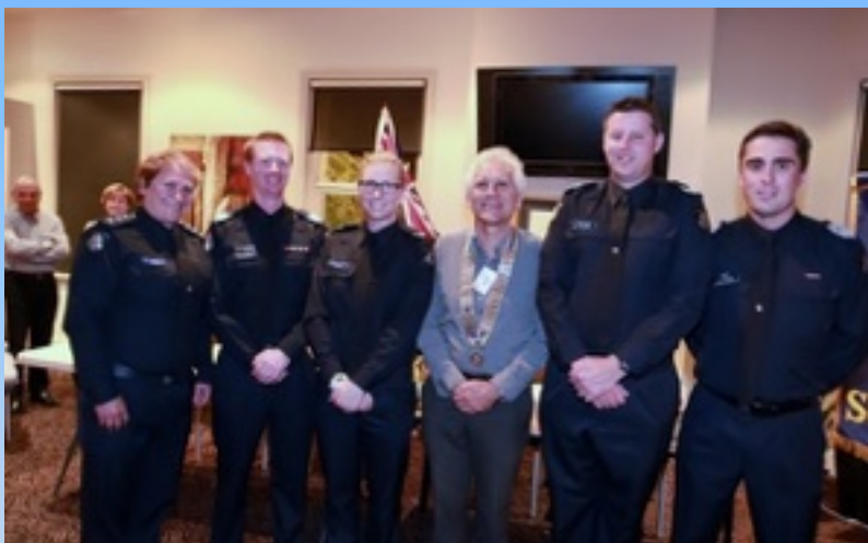
Police Person of the Year Nominations

We make donations to organisations as Sunbury Police Youth Projects, Care Works, Local Police Person of the Year, Primary School garden projects and work at the Sunbury Cemetery.