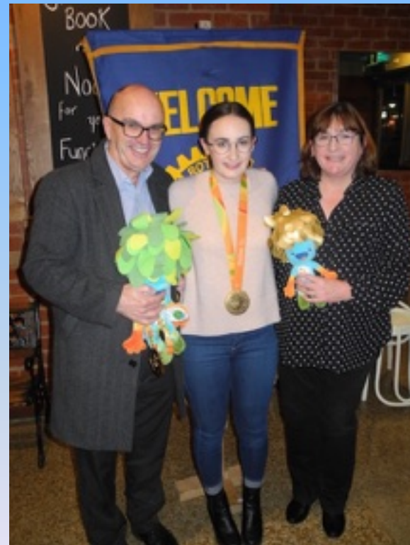
With her Parents