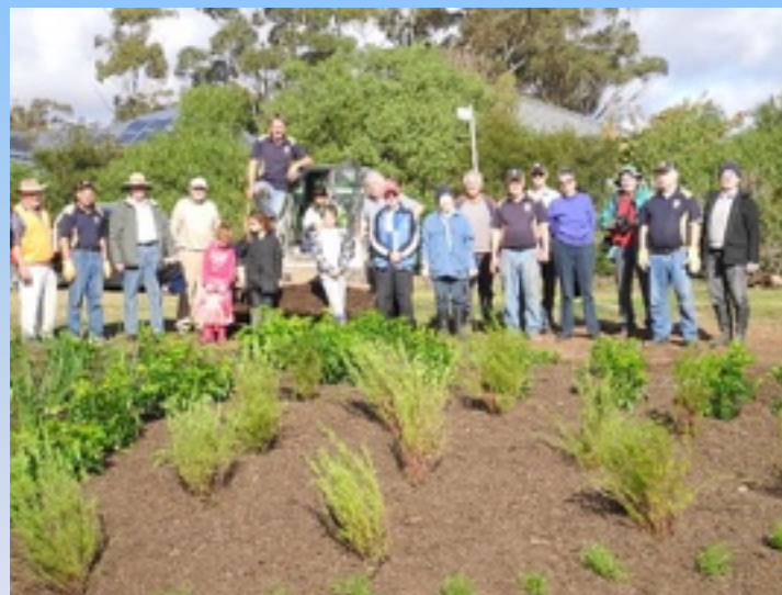
Club Members with Friends of the Sunbury Cemetery