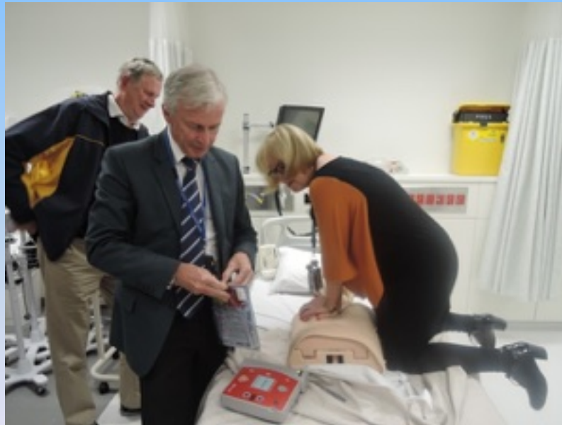
A Visit to Epworth Health - Practice in CPR

Club members also partake in Vocational Visits to enlarge their knowledge of industry etc.