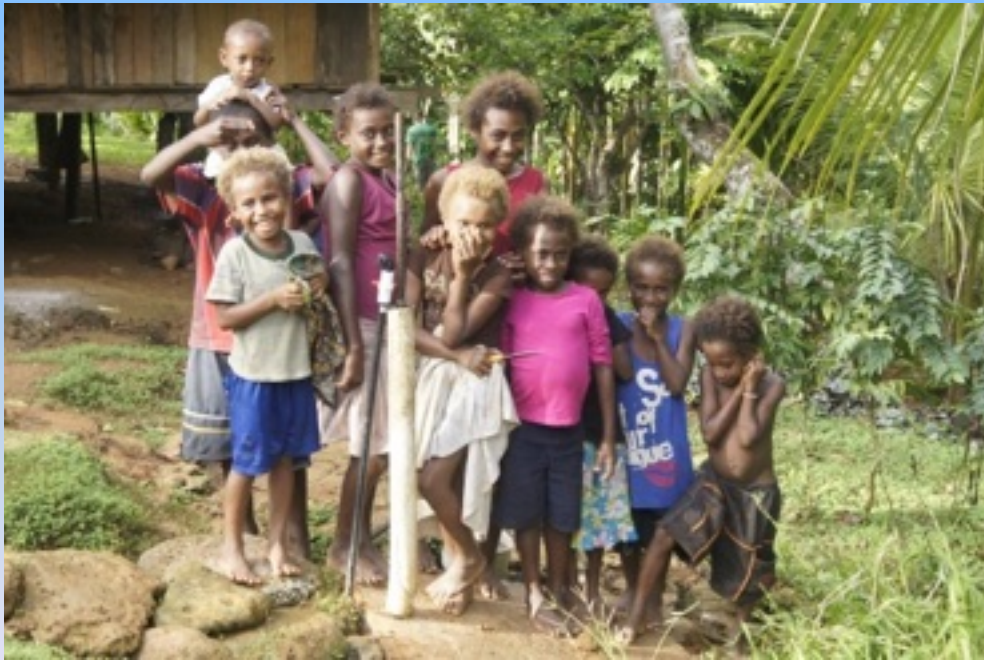
Smiling children after having access to clean running water

Solomon Islands Project - This is a Rotary Australia World community Service, RAWCS, project where a team went to the Solomon Islands in May 2016. The project is to provide potable water supply together with proper sanitation and drainage to the Heranigau and TeTeRe Communities on San Cristobal Islands. This project was done in conjunction with South Pacific Allied Health and our member Lawrence Staub.