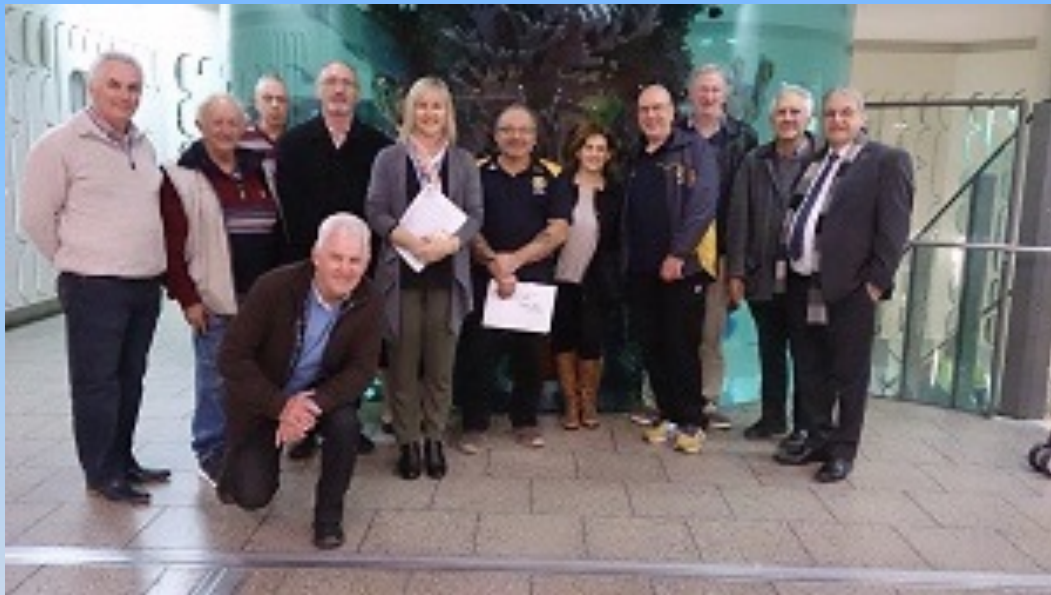
Members with Hospital Representatives after a cheque presentation

Every year we donate approximate sum of $7500 to support the running of a Post Natal Cot at the Royal Children's Hospital.