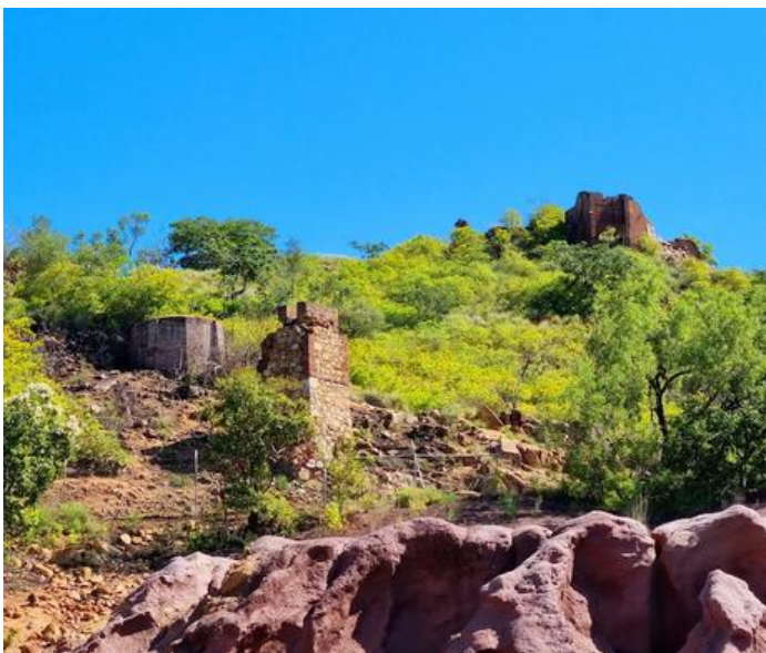
Old Gold Mine Area

Charters Towers is a rural town in the Charters Towers Region, Queensland, Australia. It is 136 km by road south-west from Townsville on the Flinders Highway. During the last quarter of the 19th century, the town boomed as the rich gold deposits under the city were developed.