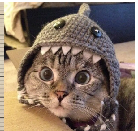
A day in the life of a Cat