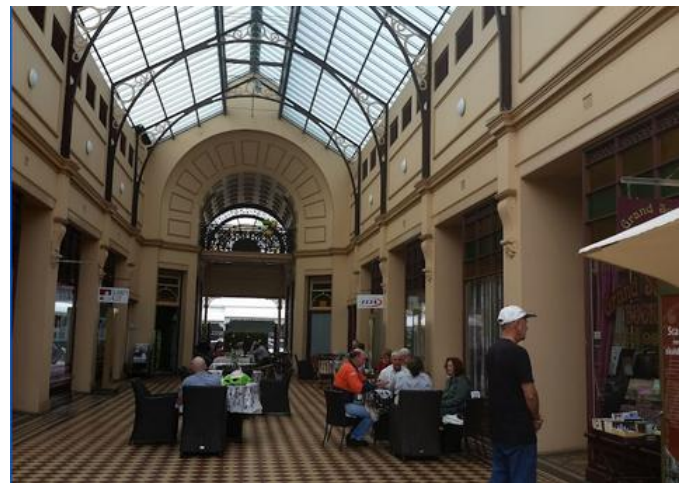
Old Gold Exchange Building