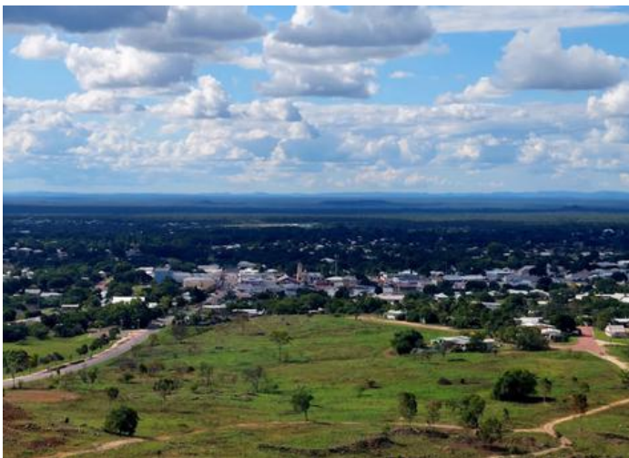
Town View from Towers Hill